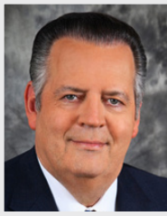
Richard D. Land

B.D., Luther Rice Bible College; B.A., Dallas Baptist University; M.A., Liberty University; Ph.D., Southeastern Baptist Theological Seminary